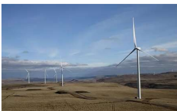
Boco Rock wind farm