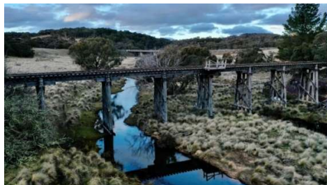
Maclaughlin River rail bridge